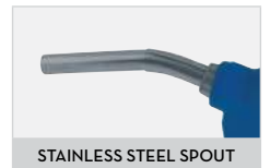
STAINLESS STEEL SPOUT